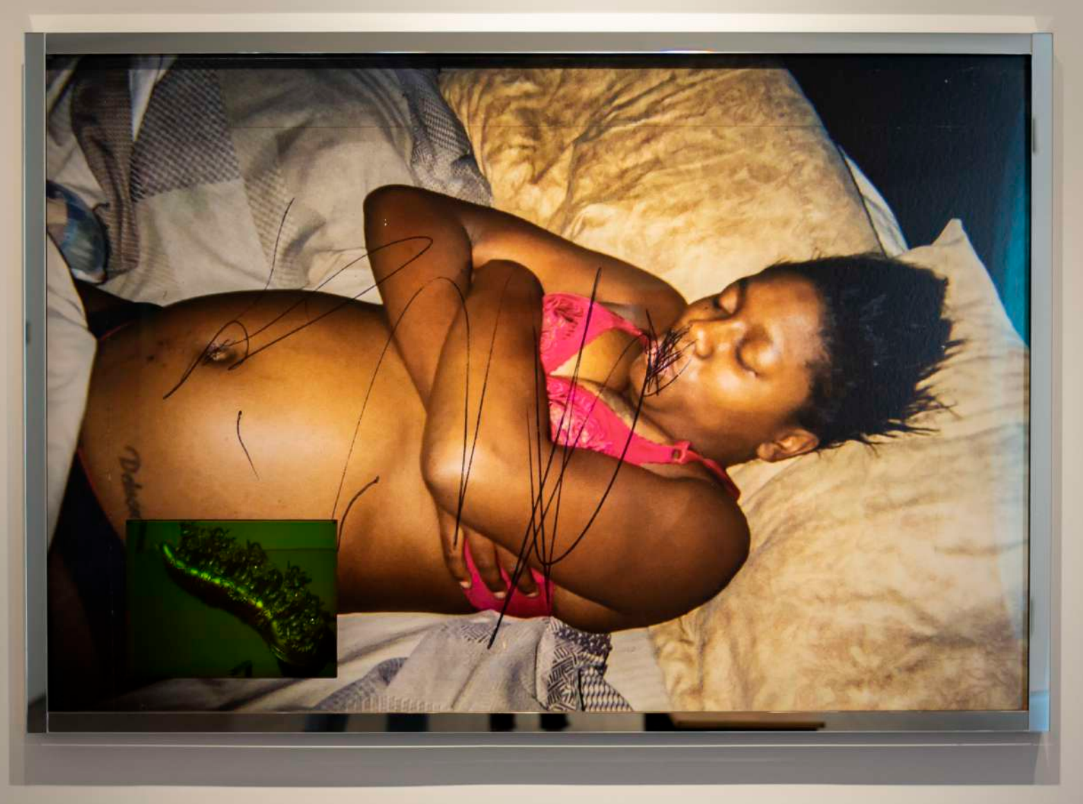
Image 4. Installation image of the Deutsche Börse Photography Foundation Prize 2022 winner Deana Lawson at The Photographers' Gallery, London