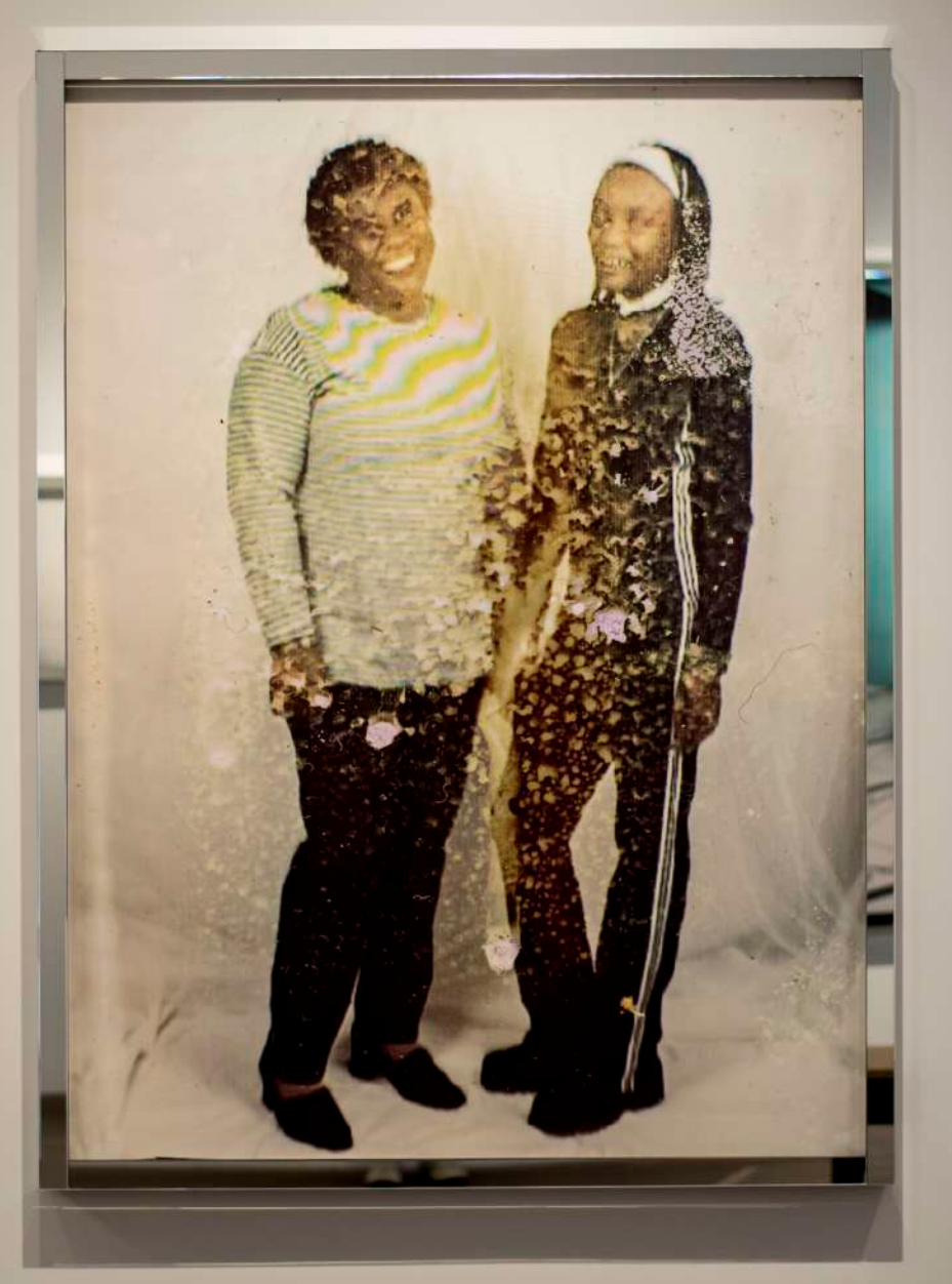
Image 3. Installation image of the Deutsche Börse Photography Foundation Prize 2022 winner Deana Lawson at The Photographers' Gallery, London