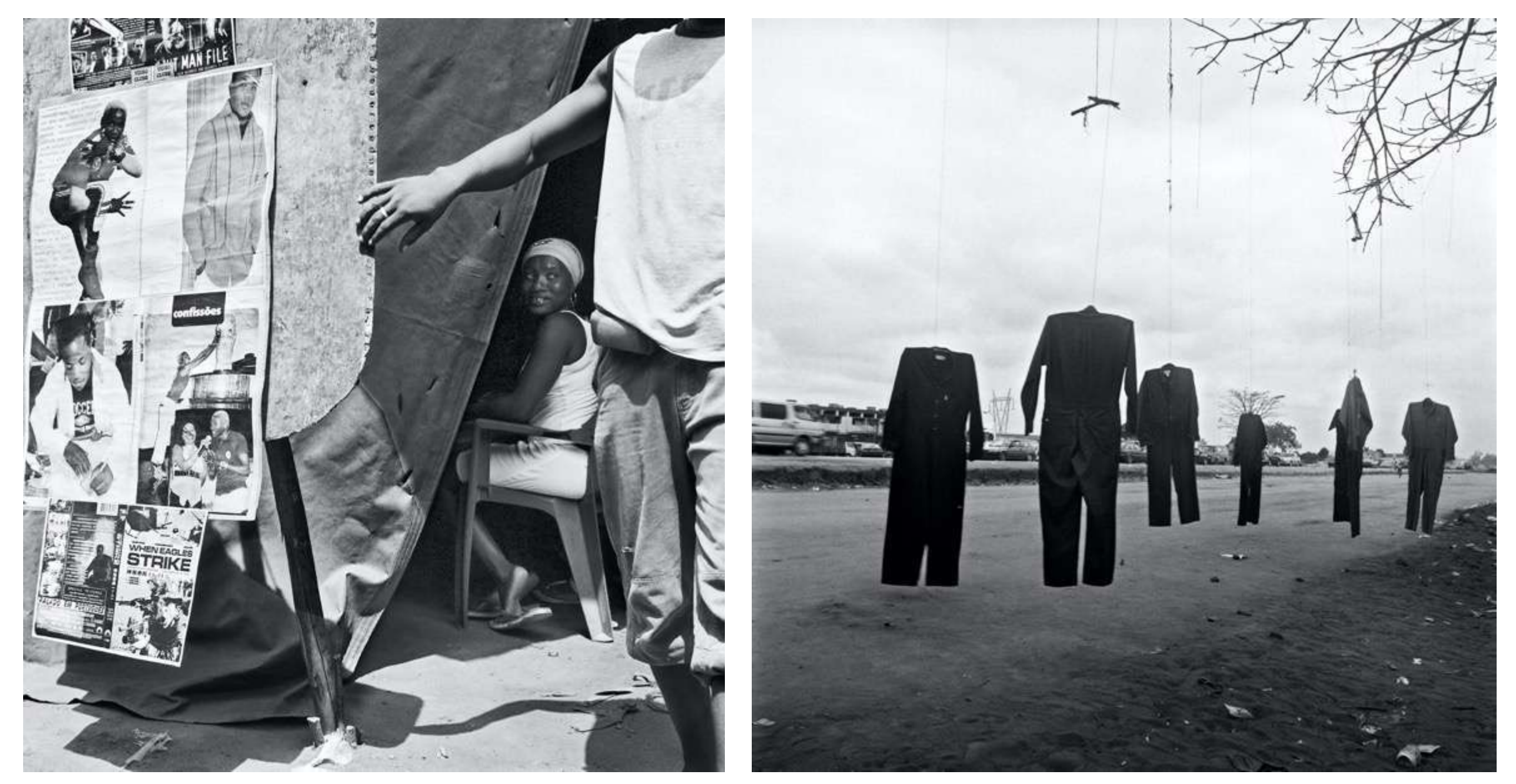
Image 9. Jo Ractliffe, Video club, Roque Santeiro market, 2007 From the series Terreno Ocupado © Jo Ractliffe