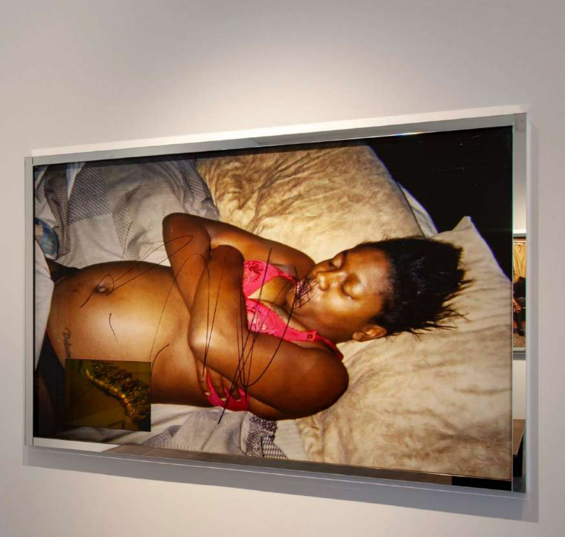
Image 6. Installation image of the Deutsche Börse Photography Foundation Prize 2022 winner Deana Lawson at The Photographers' Gallery, London.