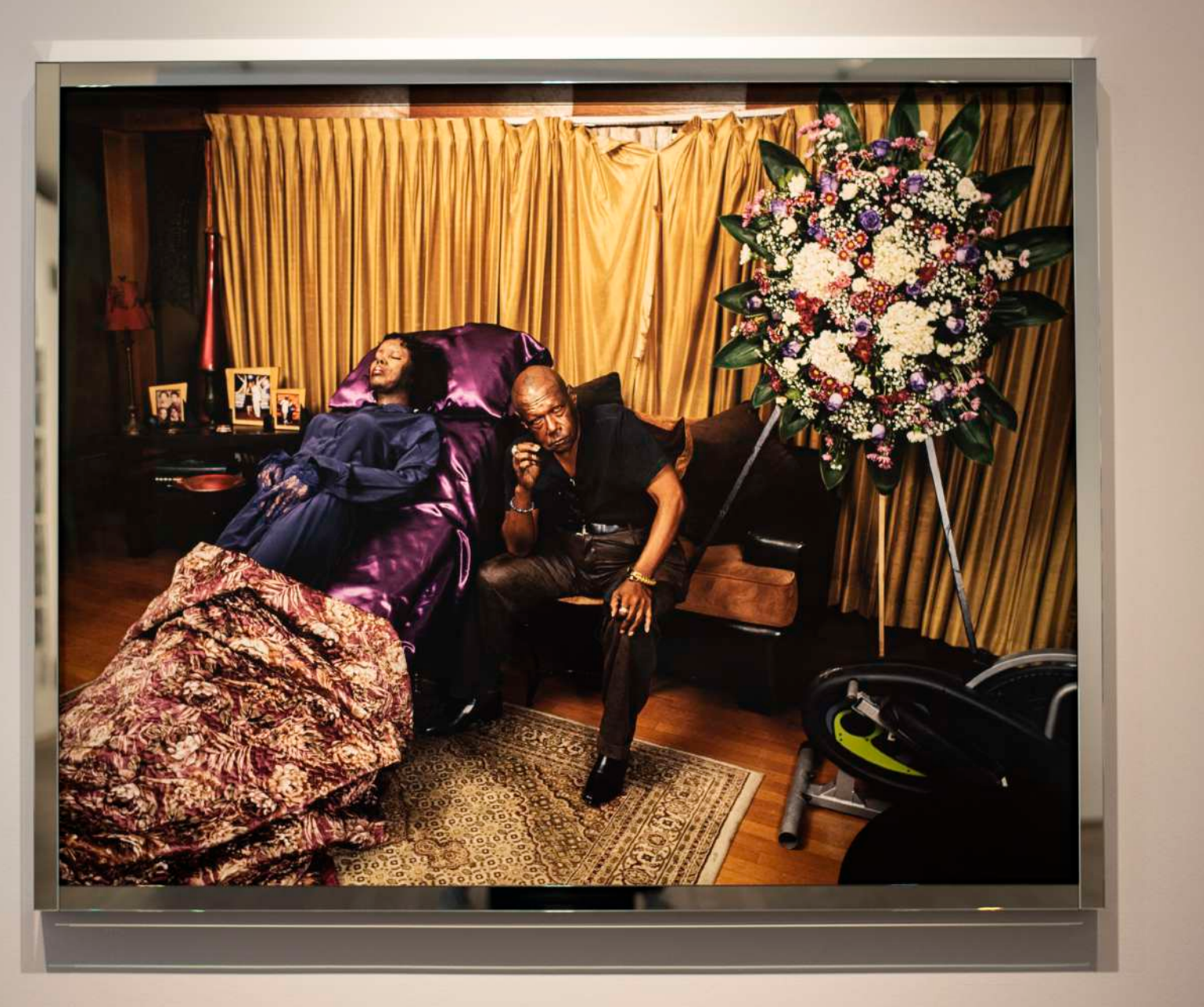
Image 5. Installation image of the Deutsche Börse Photography Foundation Prize 2022 winner Deana Lawson at The Photographers' Gallery, London