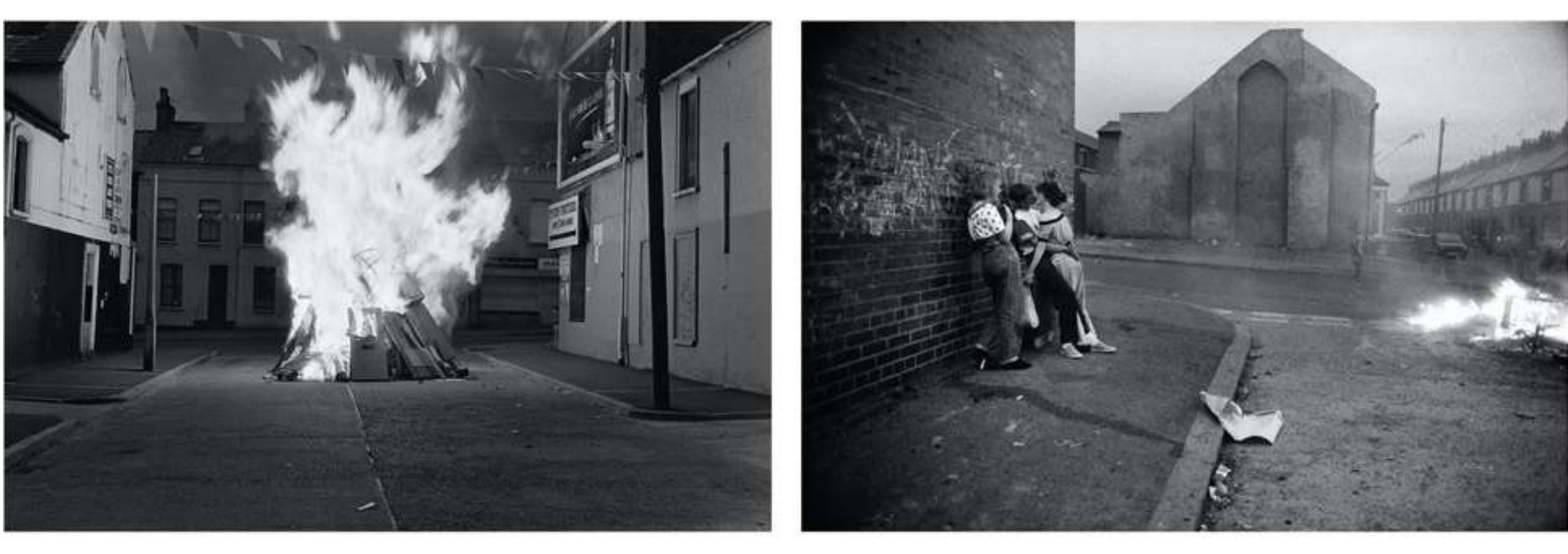
Image 11. Gilles Peress, Whatever You Say, Say Nothing: from the chapter, The Last Night