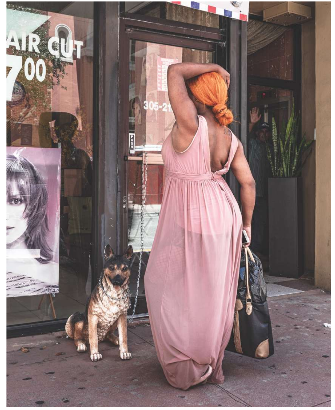
Image 7. Anastasia Samoylova, Barber Shop, Miami, 2018, from the series FloodZone