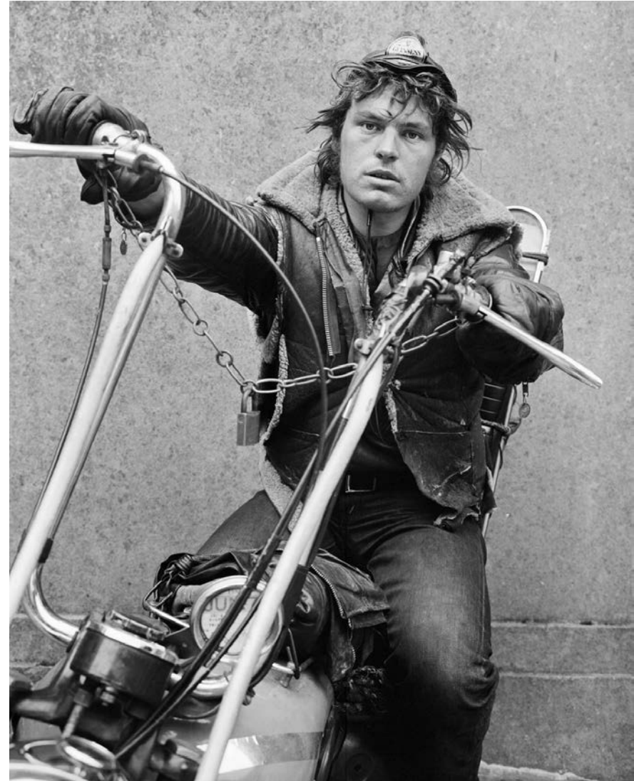
IMAGE 5 TT Races Supporter, Isle of Man, 1971