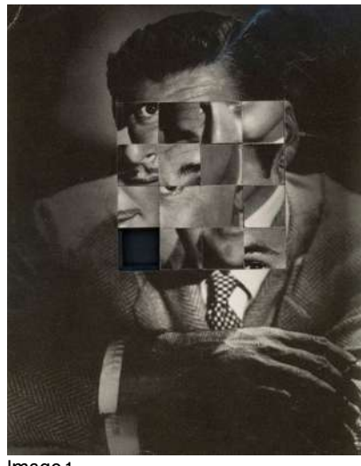
Image 1 Kensuke Koike Homework, 2020 Unique altered postcard, plastic 16.7 x 12.2 cm