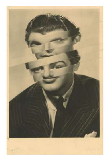
Image 5 Kensuke Koike Out of Sight, Out of Mind, 2016 Unique switched vintage photograph 14 x 9.1 cm