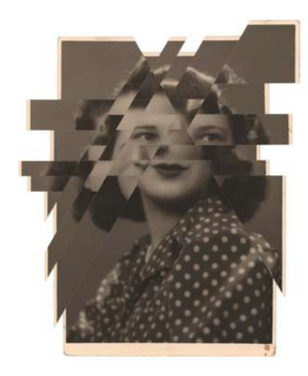
Image 3 Kensuke Koike Mula Meme 1943, 2020 Unique switched vintage photograph 13.1 x 10.9 cm