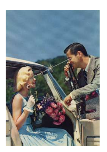
Image 4 Kensuke Koike VS, 2017 Unique cut postcard 14.8 x 10.4 cm