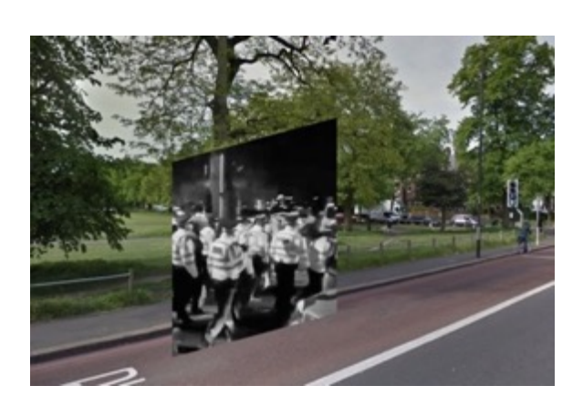
Image 12 TNT21 RAKE Collective Streetview Police, 2021