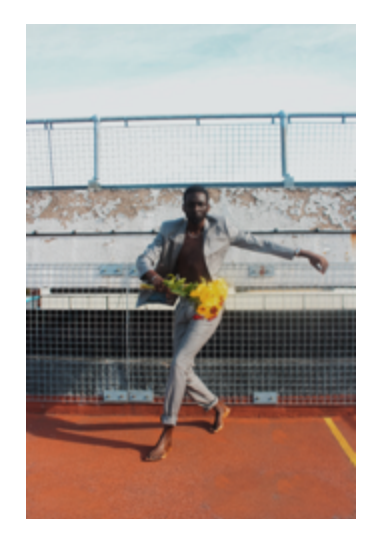
Image 7 TNT 21 Mariam Sholaja From the series UP, 2019