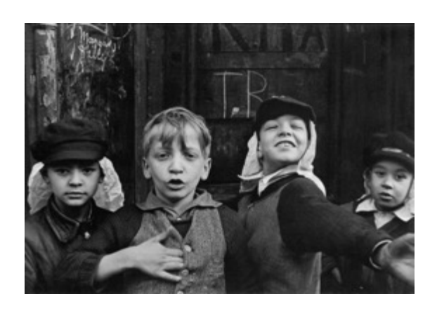
Image 2 Helen Levitt New York, 1940