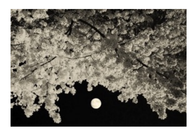
Image 15 Paul Cupido Moon Addict II, 2021 Paul Cupido