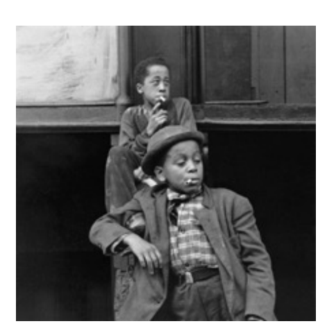
Image 3 Helen Levitt New York, 1940