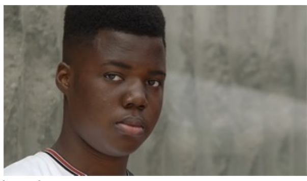
Image 6 Helen Cammock Still from Concrete Feathers and Porcelain Tacks, 2021 Helen Cammock