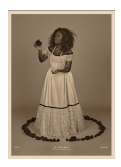
Image 8 TNT 21 Heather Agyepong Caucasian Chalk Circle, 2020