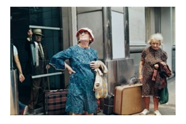
Image 1 Helen Levitt New York, 1940