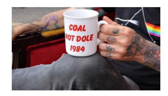
Image 4 Helen Cammock Still from Concrete Feathers and Porcelain Tacks, 2021 Helen Cammock